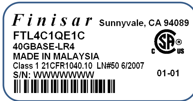
Figure 3 – FTL4C1QE1C production label