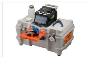
Carrying case with worktable CC-72