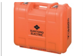
Carrying case CC-15