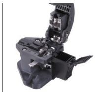
Table-top cleaver FC-5S