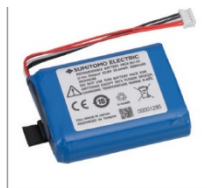
Battery pack BU-15