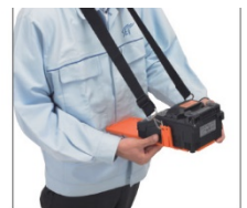
Work table WT-15