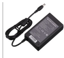
AC adapter ADC-15