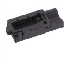
Connector holder FHS-SOC